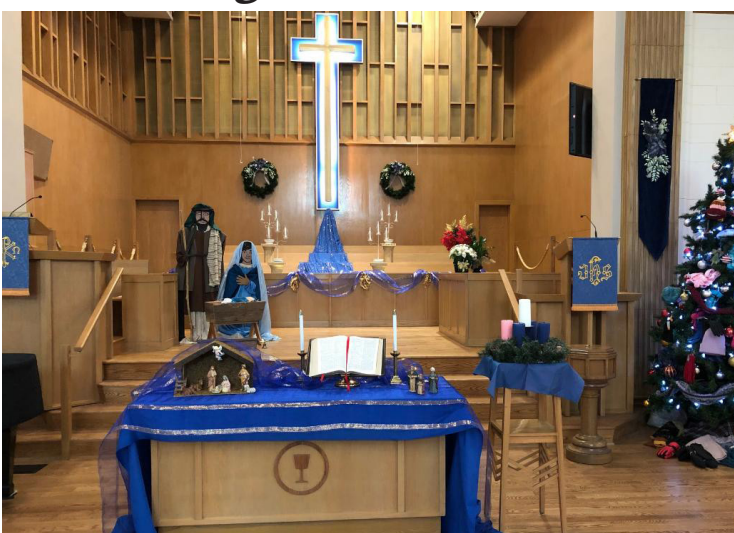
Our beautiful Sanctuary... ready for the Christmas Eve Service.