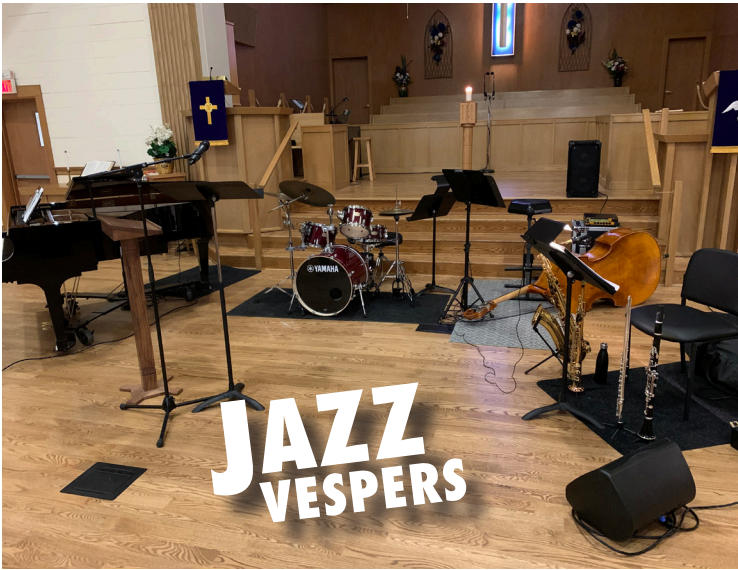
The calm before the storm...