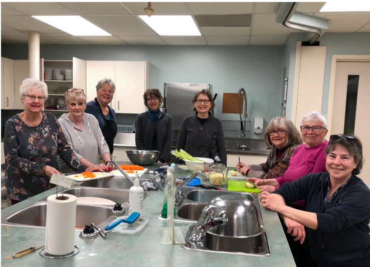
The Outreach Committee made soup for the lunch following the Calvary Annual Meeting.