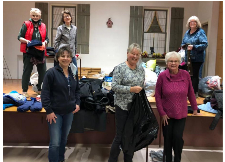
Sorting & Smiling... on December 7, members of the Outreach Committee got together to sort the clothes donated for Ark Aid. There were numerous bags of clothing for men, women and children thanks to the generosity of the Calvary community.