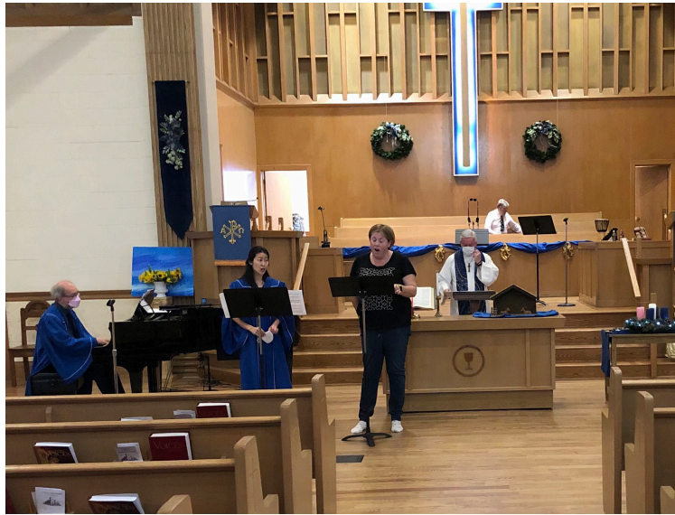
Warming up... Music Sunday Service rehearsal.