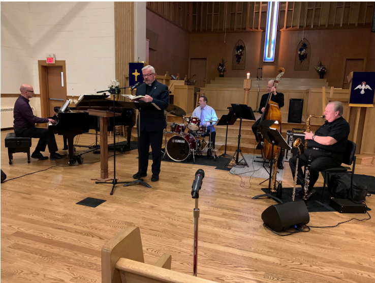
Jazz Vespers...when the Saints go MARCHing in...