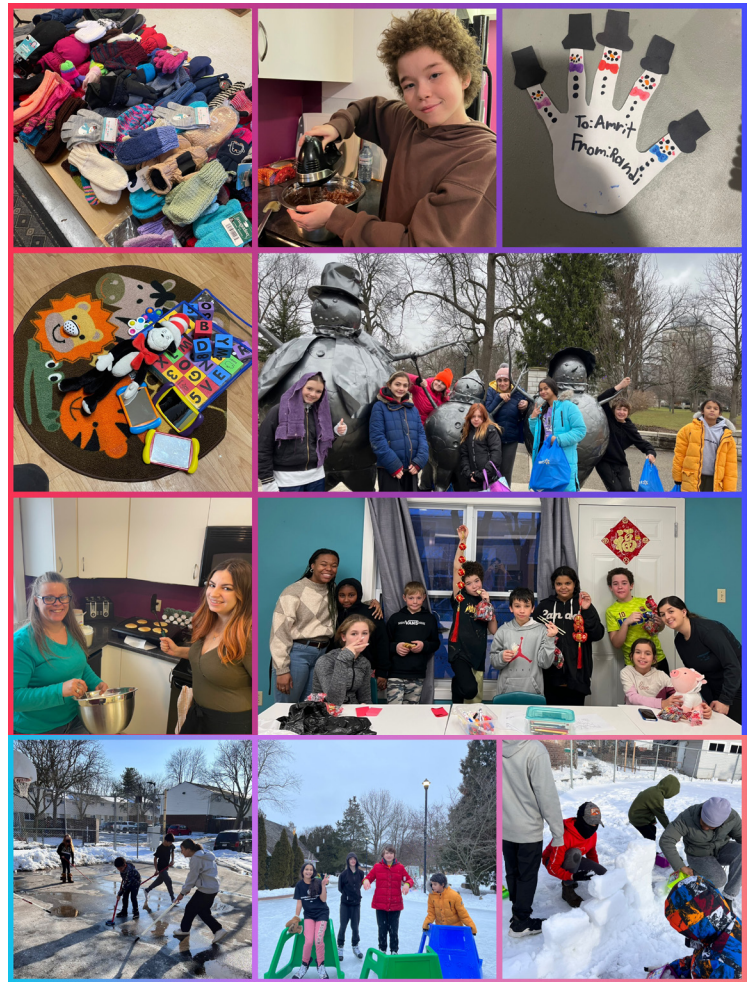
The Chaplaincy says thanks Calvary for your support and generosity!