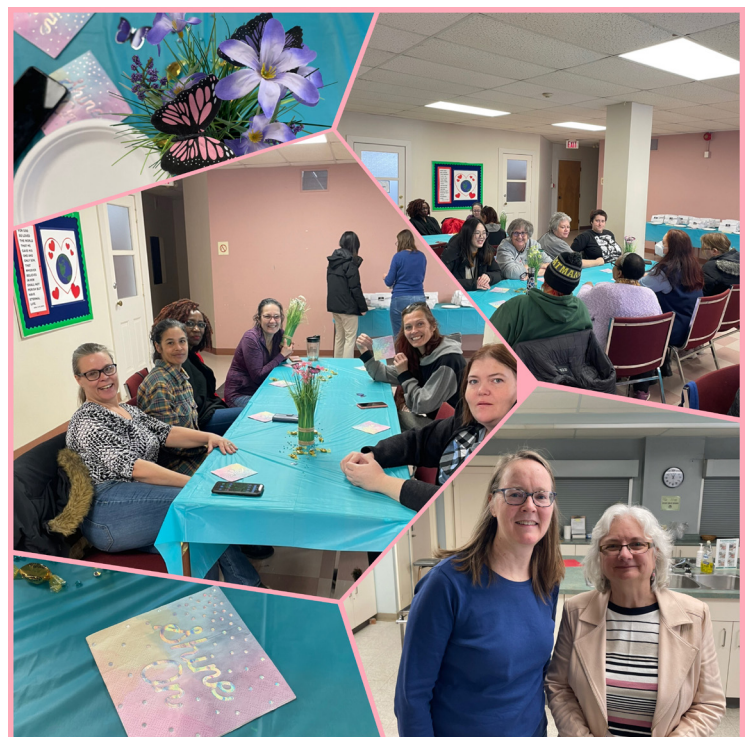
International ladies day lunch. (Calvary let us use space)

They were taken to the London Community Chaplaincy to be distributed to the families at Southdale and Limberlost.