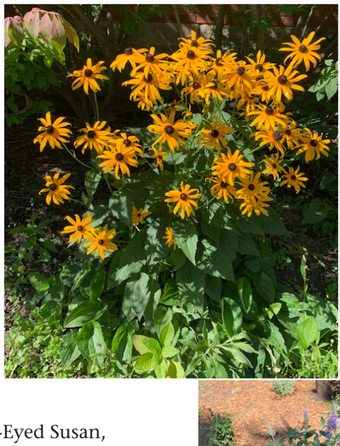
Some of the plants in the pollinator garden... the work of the Calvary Green Team.