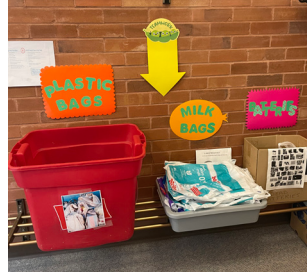
Here is where some of the recycling items can go when folks walk through the passage to the sanctuary.