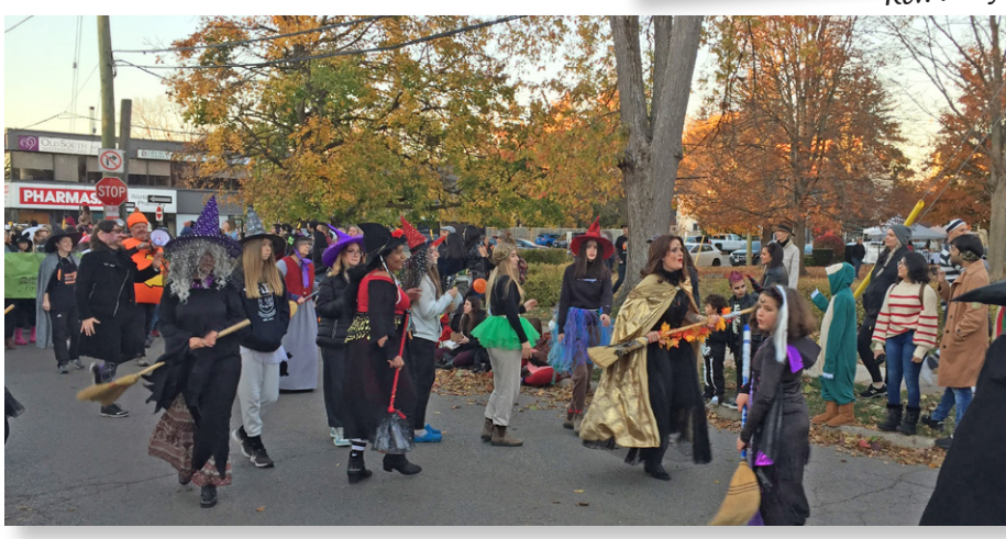
On parade... the Witches of Wortley.