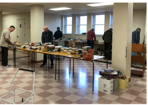
Sorting the books into categories...